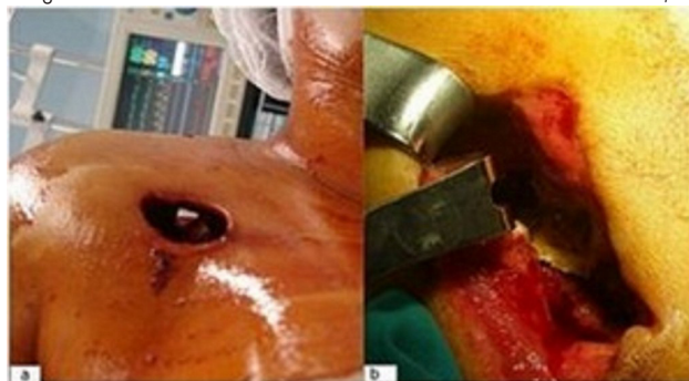
Figure 1. Anterior view of defect (seen as posterior plan)(A), posterior view of defect(B).

We applied VAC treatment instead of using a different muscle flap for the site which could not be filled by muscle flap at the anterior of lesion. VAC method is used for complex surface wounds, diabetics, radiation and venous stasis dependent developed ulcer or complicated surgical wounds. VAC allows for decrease in the wound site edema, in-